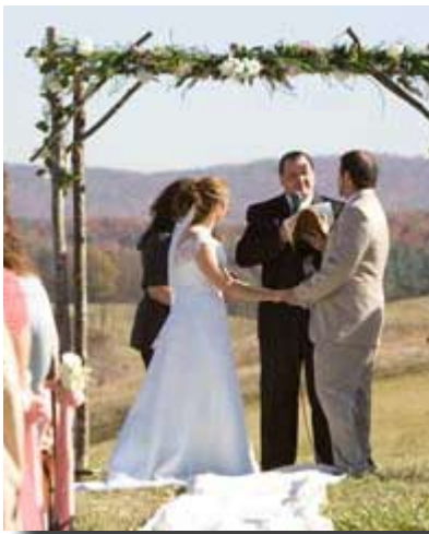
your special day...